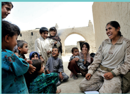
Cover Image: Manal Al Dowayan: I AM a UN Officer

Beyond Borders, in partnership with the European Institute of Peace and Edinburgh’s Summerhall, is delighted to present the Women in Conflict Initiative . The Initiative seeks to highlight and capture the experiences and different roles that women play in conflict. To that end we are running a series of events in Edinburgh and the Scottish Borders employing a range of different mediums, as well as a short residential Fellowship programme over the Beyond Borders International Festival (BBIF) . Nicola Sturgeon MSP, First Minister of Scotland and Staffan de Mistura, UN Special Envoy to Syria, will launch the initiative during the Festival weekend.